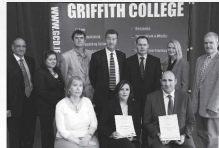
Chartered Accountants Ireland Prize Winners 2010 and Lecturers

Griffith College Placings include 1st Place in the CAP 2 Examination and 2nd Place in the FAE Examination